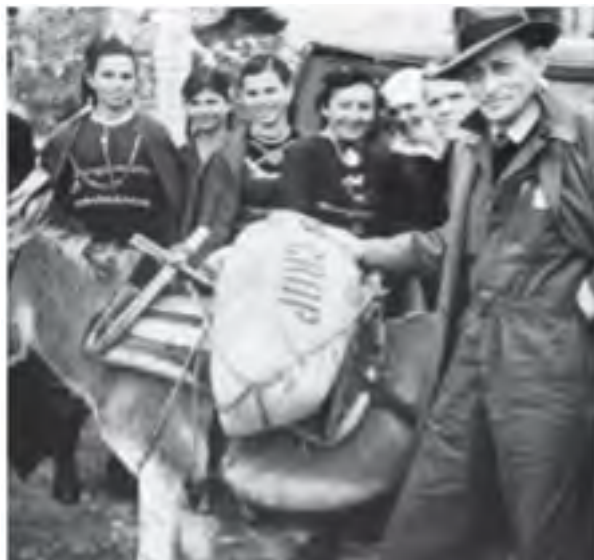
Post war CROP delivery